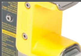
(A) Beam glide