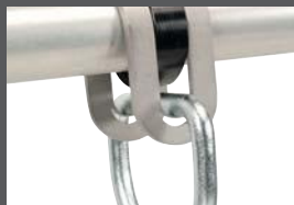
(B) Load indicator