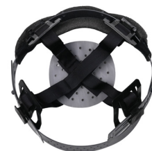
HP140 – 4-point snap lock