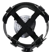
HP141 – 4-point ratchet suspension