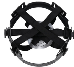
HP160 – 6-point snap lock