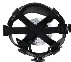
HP161 – 6-point ratchet suspension